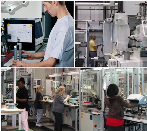
AUBURN'S TOTAL WORKFORCE CONSISTS OF 25,000 WHICH INCLUDES 5,200 JOBS IN MANUFACTURING.